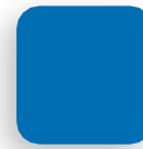
ROYAL BLUE 329