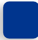
DARK BLUE 303