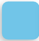
DAWN BLUE 328