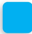
DAWN BLUE 328